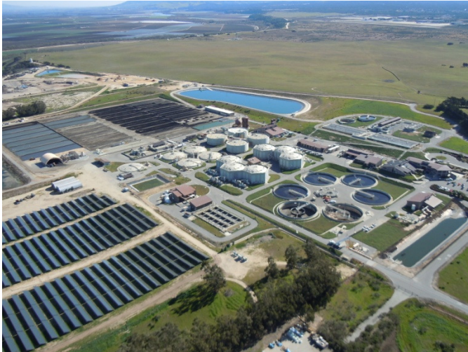
MRWPCA's Regional Wastewater Treatment Plant and Salinas Valley Water Reclamation Project with Solar City's 1.12 megawatt solar facility in the left foreground.

Visit MRWPCA's award-winning wastewater treatment plant and water recycling facility FREE of charge the 3 rd Friday of each month.